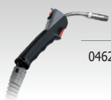
Push Pull Torch (24 V)

046283 | 4 m | 3 kg | 220 A (20%) | 0.8 → 1.2