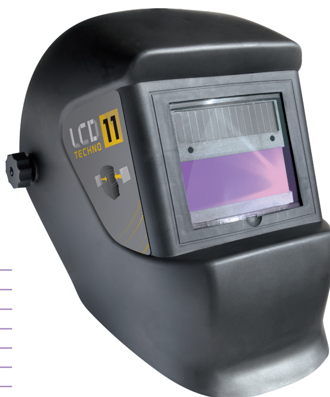
delivered with headband