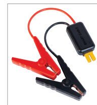
Smart jump lead