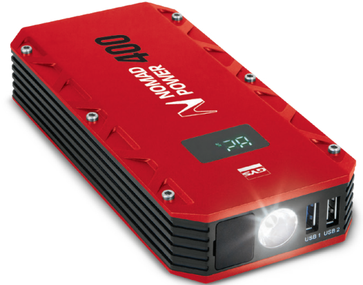
Colour LCD display

Lightweight (498 g) and compact , it will ideally find its place in a vehicle's glove box/tray as well as in a suitcase.