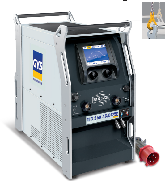
Supplied without accessory