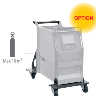
Trolley ref. 040960

Easy mode or PRO mode with access to every parameter.