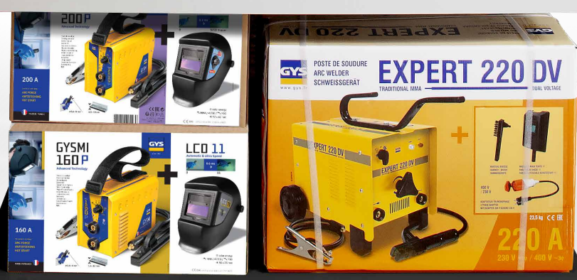
Traditional welding station

With GYS POS stand : 061026 Without GYS POS stand : 061033