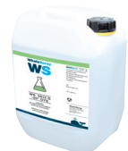
PN. 062511 Welding coolant - 5 l