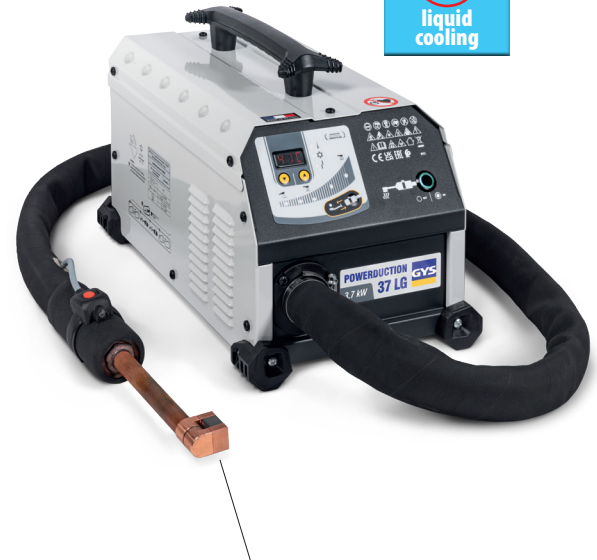
Supplied with a complete inductor 90°