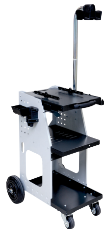
PN. 051331 + 052284 UNIVERSAL 800 + Over hanging arm