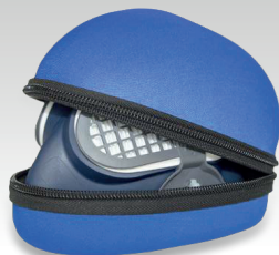
Storage case 037045