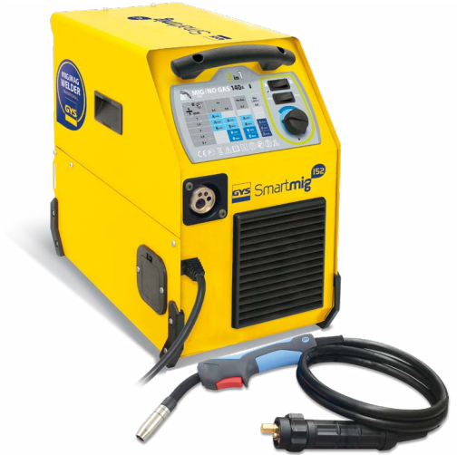
Earth Clamp and 2 m EURO torch included.

Constant running fan protects unit against overheating.