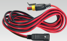
Extension 2.5 m - 029057