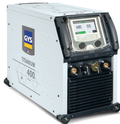
Delivered without accessories (optional trolley)