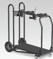
Trolley 10m³ 037328